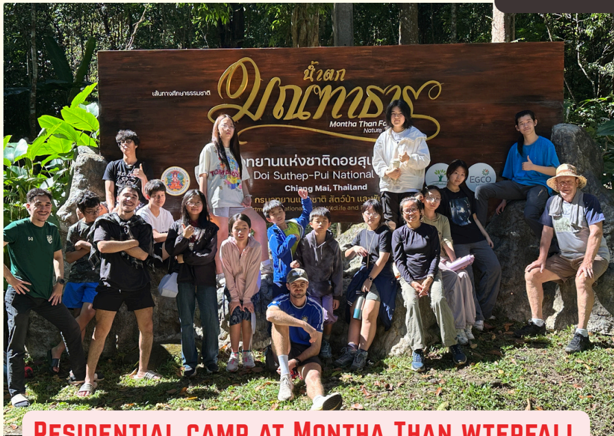
RESIDENTIAL CAMP AT MONTHA THAN WATERFALL