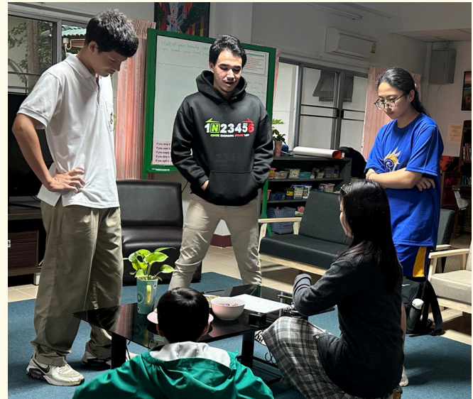
Pre-camp group organization