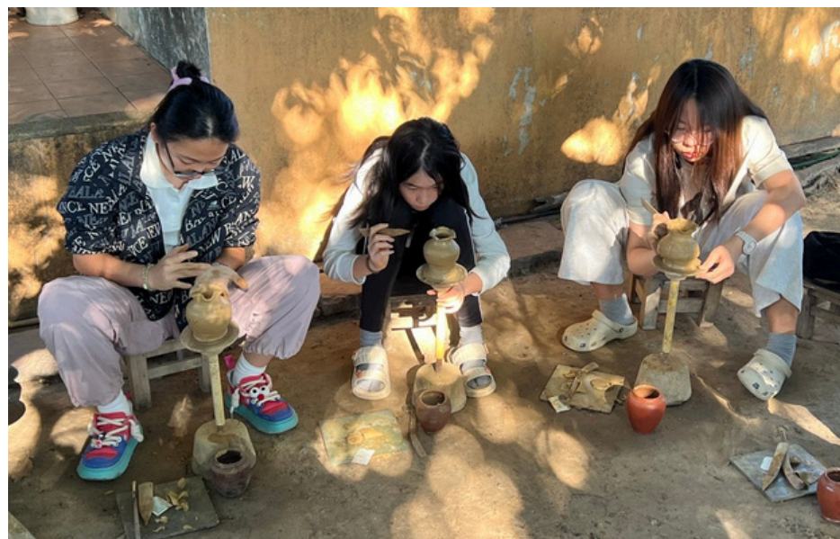
LEARNING HOW TO MAKE A POT ON A POTTERY WHEEL