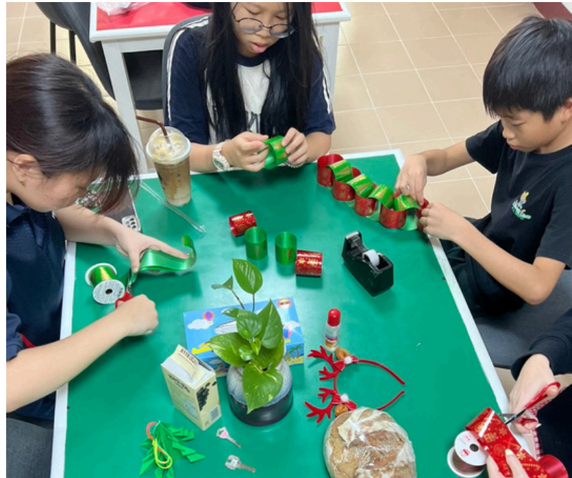
Making some Christmas decorations