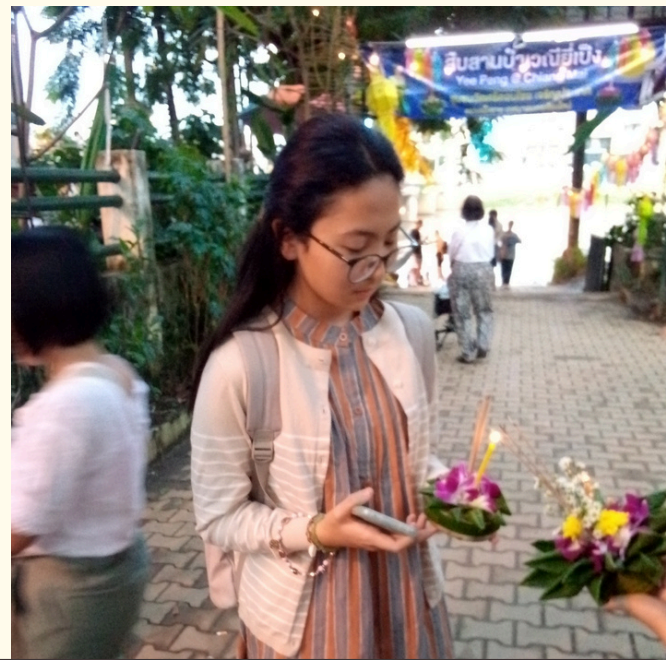
LOY KRATHONG CELEBRATIONS DOWNTOWN